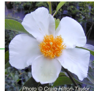
Franklinia, Franklinia alatamaha

A taxon is Extinct in the Wild when it is known only to survive in cultivation, in captivity or as a naturalized population (or populations) well outside the past range.