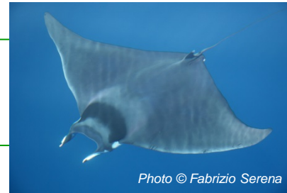
Giant Devil Ray, Mobula mobula

EN taxa are considered to be facing a very high risk of extinction in the wild