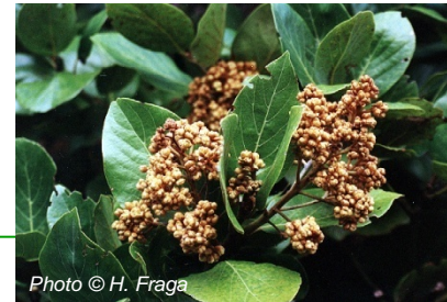
Macaronesian Laurel, Laurus azorica

A taxon is Near Threatened when it has been evaluated against the criteria and does not qualify for CR, EN or VU now, but is close to qualifying for or is likely to qualify for a threatened category in the near future.