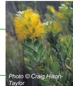
Golden Pagoda, Mimetes chrysanthus

VU taxa are considered to be facing a high risk of extinction in the wild