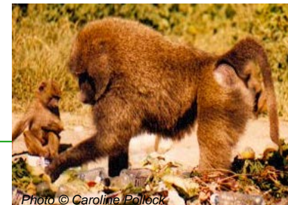
Olive Baboon, Papio anubis

A taxon is Least Concern when it has been evaluated against the criteria and does not qualify for CR, EN, VU or NT. Widespread and abundant taxa are included in this category.