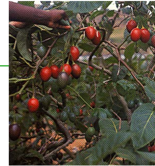
Tree Tomato Solanum betaceum

A taxon is Data Deficient when there is inadequate information to make a direct, or indirect, assessment of its risk of extinction based on its distribution and/or population status.